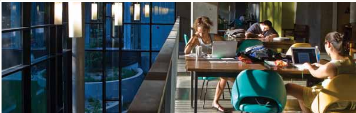
Designed to be a truly 21st century library, the newly renovated McHenry Library will feature wireless networking throughout the building and in the lawn area outside, a film and music center, a visual resource center, and a “cyber study” room and café.

Admission by Exception is granted to a very small percentage of applicants who do not meet the UC transfer requirements. Such factors as academic accomplishments in light of your life experiences and/or special circumstances, socioeconomic background, special talents and/or achievements, contributions to the community, and the quality of your personal statement are taken into consideration. UCSC does not grant exceptions for the required courses in English composition or mathematics.