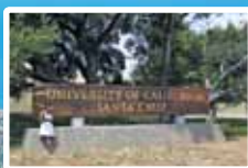
Main campus entrance